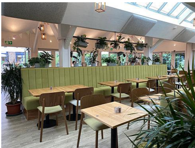
Lunch stop - RHS Rosemoor Restaurant

The Third Thursday ride on 19th December will be led by Barrie Dennett and start & finish at Marsh Barton 9:30 for 10:00 start at Pit Stop Cafe /// crush.cafe.stage and end at Bridge Cafe 53 /// humid.plant.drunk and take in some familiar good roads out via Moretonhampstead to Okehampton for a coffee stop. Proceeding then to Great Torrington and lunch at Rosemoor RHS. Returning via N Tawton to Bridge Motorcycles. 100 miles, around 2½hours riding. For full DAM members, Associates only if test ready and with their Observer. Les Mosco pilot, sweeper volunteer(s) please.