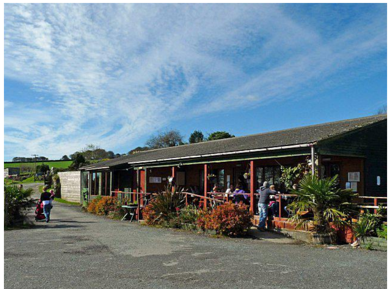
Lunch stop: Louis Tea Rooms, Kit Hill, Callington

For Full Members. Associates are welcome but only if accompanied by their Observers Please.